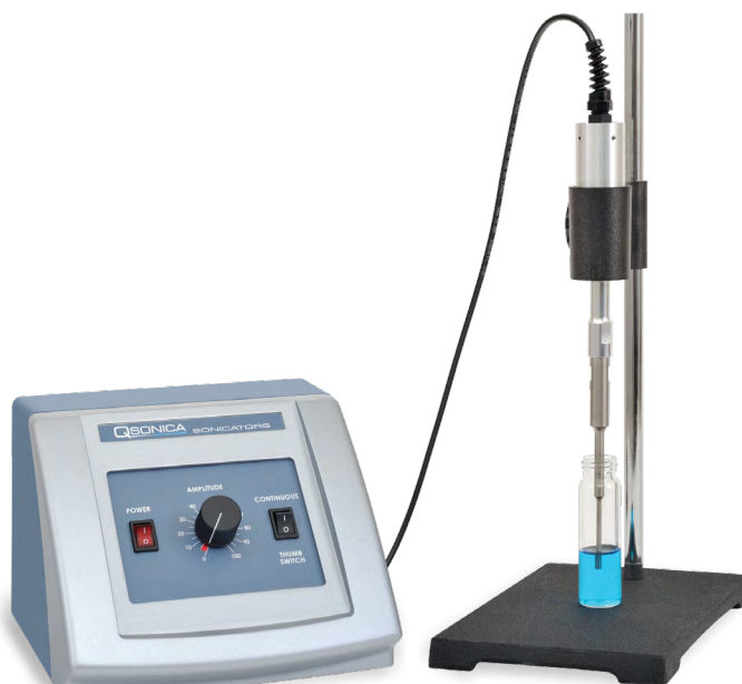
Stand sold separately.